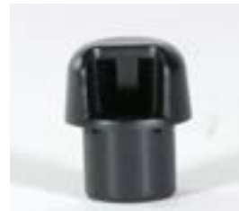
Exhaust Cover PN 1000013417