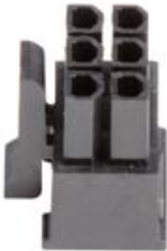
6 contact plug 4-20mA input PN 1000024958