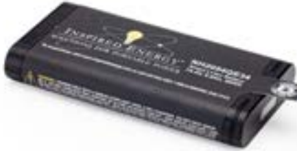
Lithium Ion Battery PN 1000025008