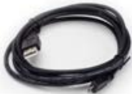
service cable USB-A to USB-micro PN 1000025093