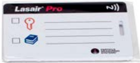
NFC Location and Recipe Tag PN 1000025099