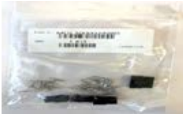
8 contact plug 4-20mA out PN 1000012554