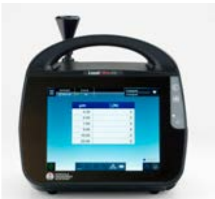
Lasair III Airborne Portable Particle Counter models and part numbers: