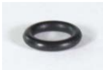
Inlet O-rings 310C = RG021 350L = RG023 5100 = RG036