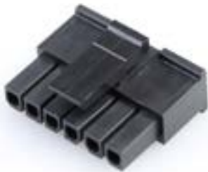
Digital out 8 contact plug PN 1000020757