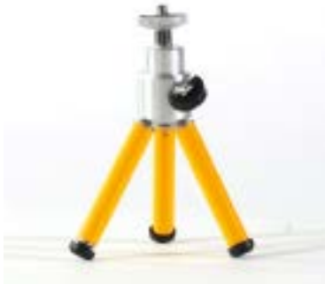
Table Tripod PN 100000979