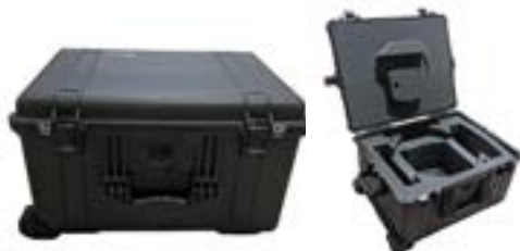
Traveling Case PN 90101292