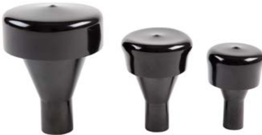
ISP 100 LPM Ultem PN 1000012577 and Plug/CAP 1000013174