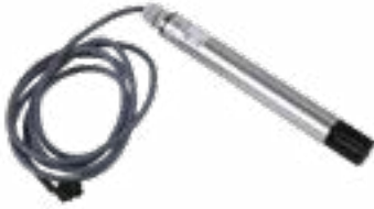
Temperature/Relative Humidity Sensor PN 501050-01