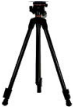
Floor Tripod PN M1008