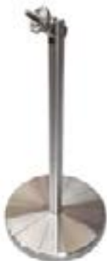
316L Stainless Steel Table Stand PN 1000023413