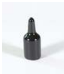
Rubber Cap over inlet 310 PN 1000000957 350 PN 1000013110 5100 PN 1000013111