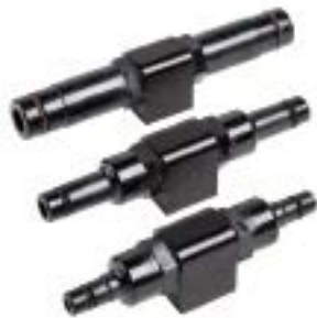
Wall/hand adaptor 1 CFM PN 1000012955