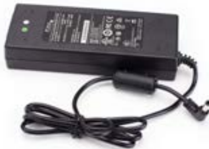
Power supply PN 1000024952